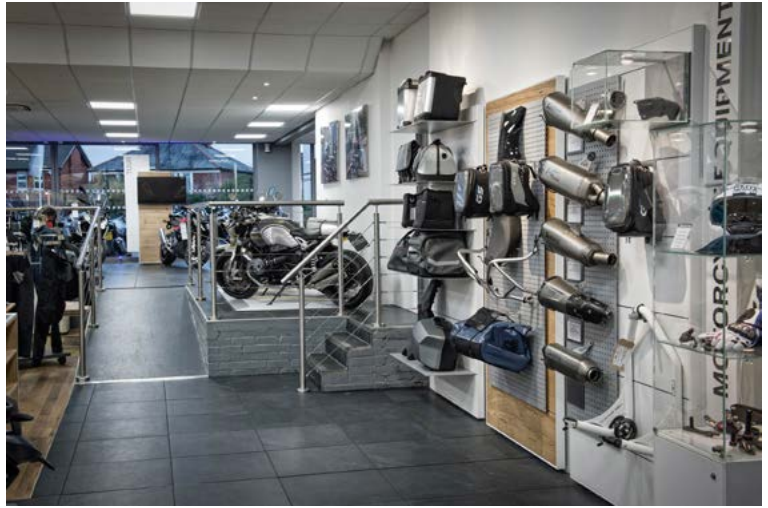
Parts and clothing area at Maidenhead