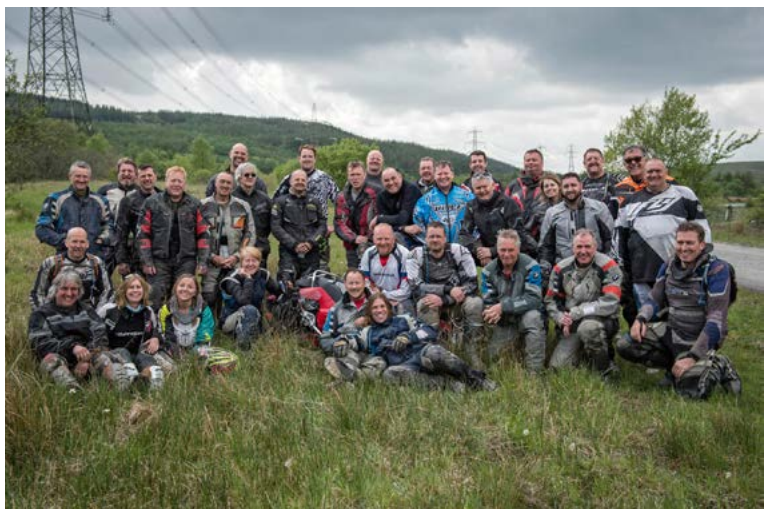
Our customer events are always popular, none more than Off Road Skills