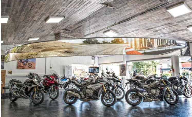
The recent alterations at Alton included lifting the showroom ceiling.