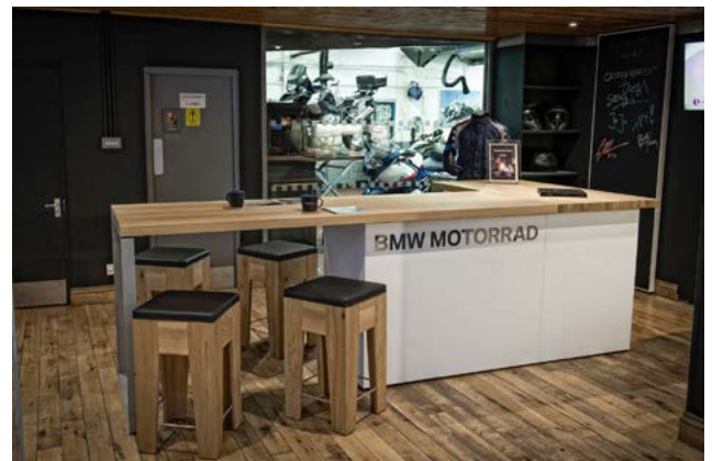
The Biker Cafe is a great communal area.

As with any business, its success is very much down to the team you have around you. People who share the same passion and have the same vision are worth their weight in gold and we are lucky to have retained many of the team that we opened the door with originally.